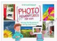
Photo Adventures for Kids: Solving the Mysteries of Taking Great Photos by Anne-Laure Jacquart

Understanding Light and Exposure: Light is the lifeblood of photography. Master the art of manipulating light to control exposure, the balance between light and dark. Discover how aperture, shutter speed, and ISO interact to shape the brightness and depth of field in your images.