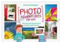
Photo Adventures for Kids: Solving the Mysteries of Taking Great Photos by Anne-Laure Jacquot

Embrace the challenges and revel in the triumphs as you navigate the world of photography. With knowledge as your guide and passion as your driving force, you will unlock the mysteries and unlock the true potential of your photographic endeavors.