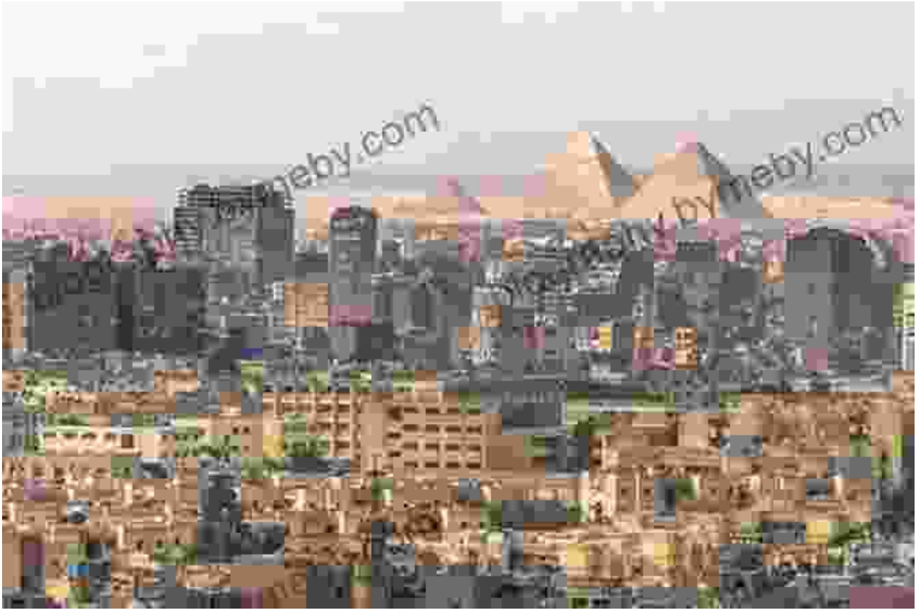
Cairo Street Scene