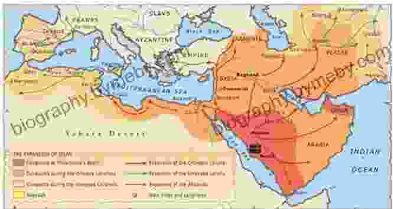
The expansion of Islam in the Middle Ages

Click here to Free Download your copy of The Ottomans, Khans, Caesars, and Caliphs today!