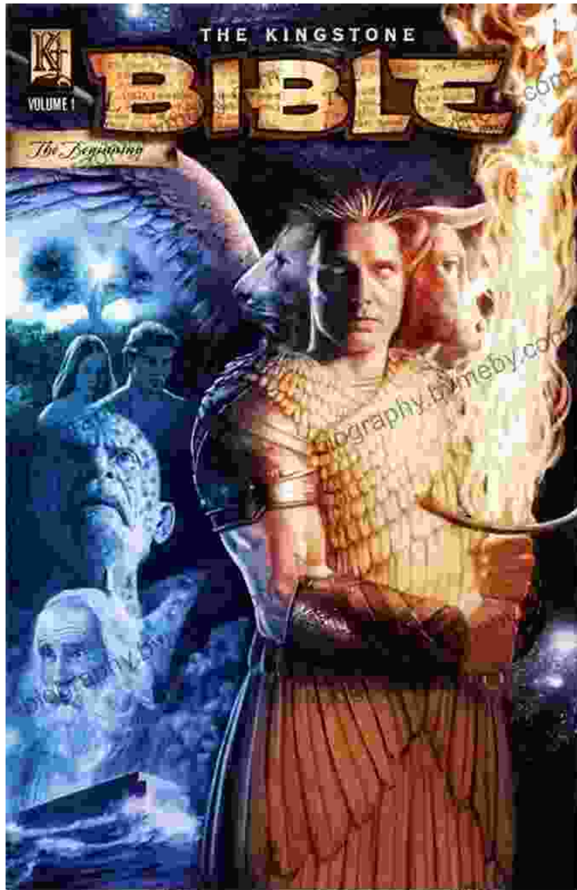
Image Description: The cover of "The Kingstone Bible Vol. The Beginning" depicts a vibrant and awe-inspiring cosmic landscape, symbolizing the vastness and wonder that await readers.