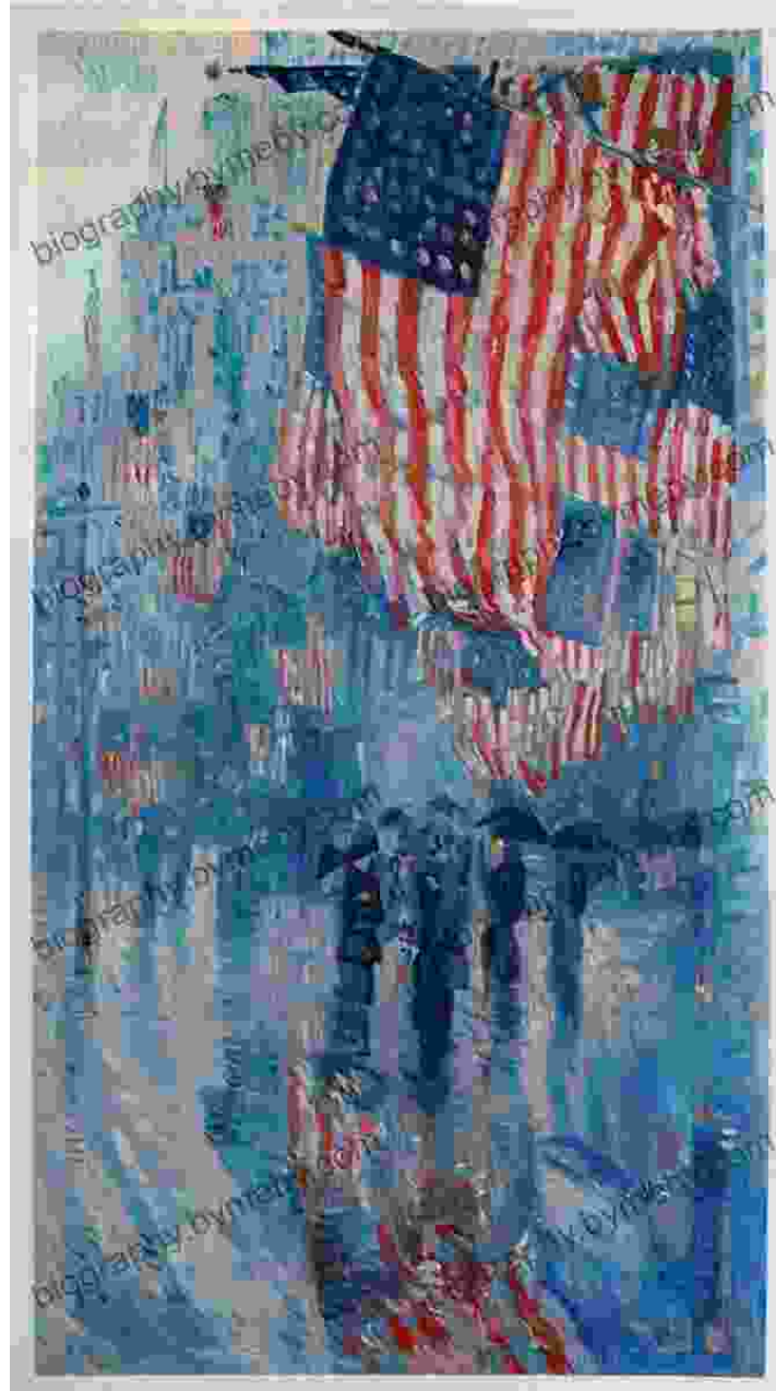
Frederick Childe Hassam, The Avenue in the Rain , 1917