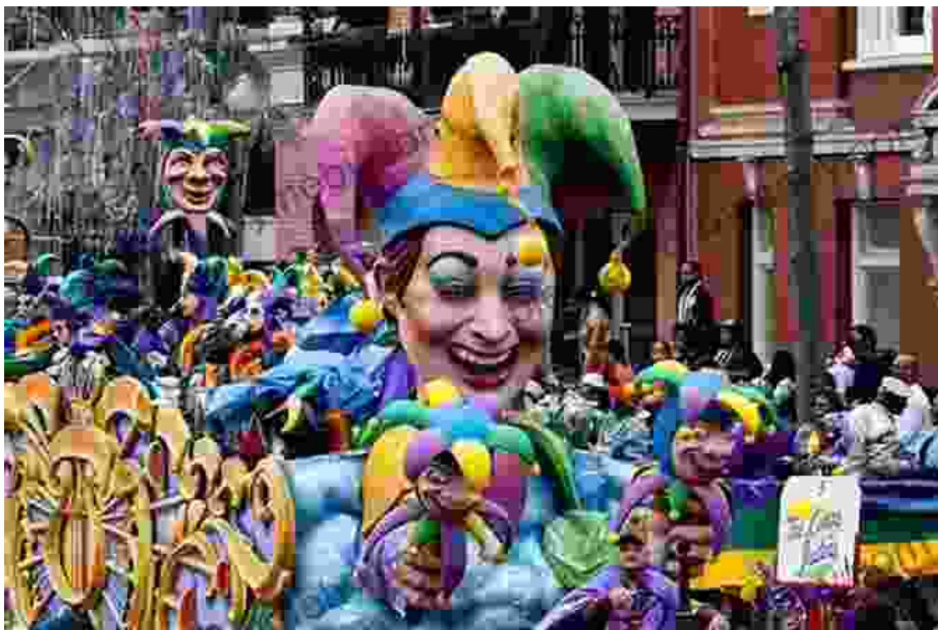
Mardi Gras revelers in New Orleans, circa 1950s.

No discussion of New Orleans music would be complete without mentioning Mardi Gras, the city's annual celebration of revelry and excess. Mardi Gras is a time when the streets come alive with vibrant parades, costumed revelers, and an endless array of musical performances. From traditional jazz bands to contemporary brass bands, the music of Mardi Gras is a joyous and infectious expression of the city's spirit.